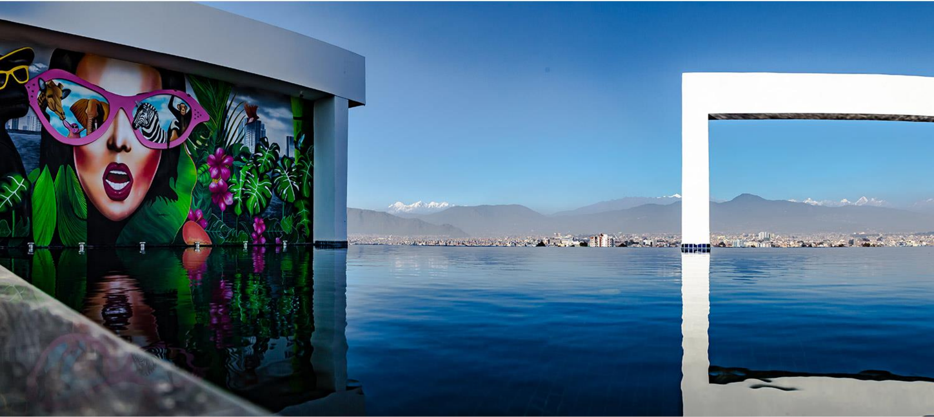
ROOFTOP HEATED INFINITY POOL