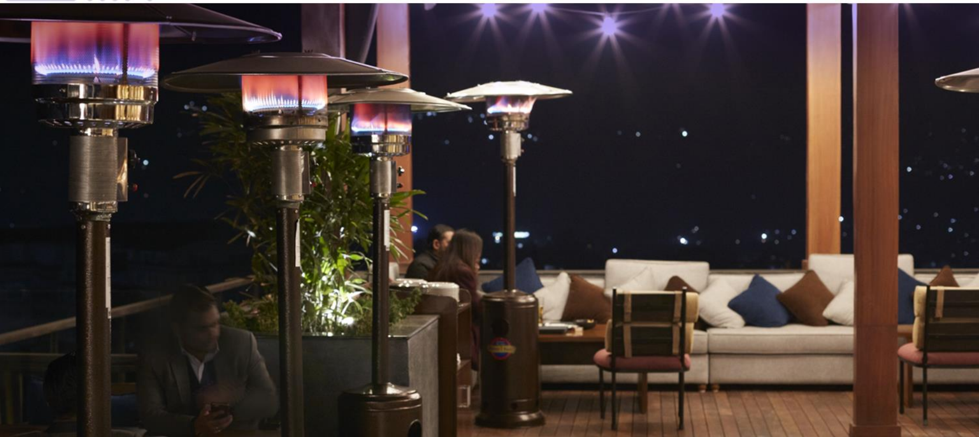
KOKO, ROOFTOP BAR