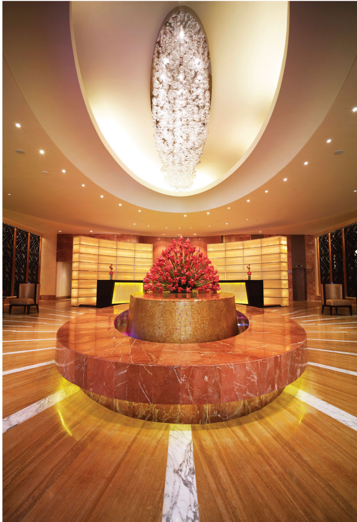
2010-07-1669 Malabar Cochin Brochure - Front Inside Cover